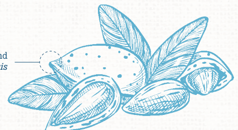
Almond Prunus dulcis